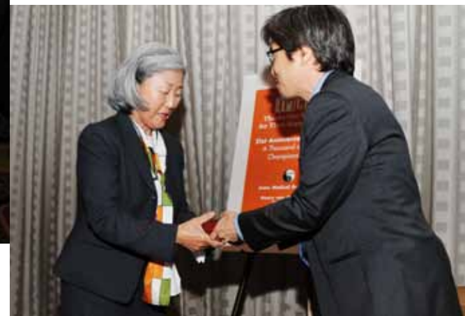
The Hon. Deborah Glick of the New York State Assembly for District 66, lauds APICHA for its singular focus in advocating HIV and sexual health-related services for Asian and Pacific Islanders and other communities of color.