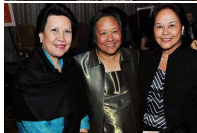
The Hon. Grace Meng of the New York State Assembly for District 22, praised the community-based HIV and primary care services of APICHA.