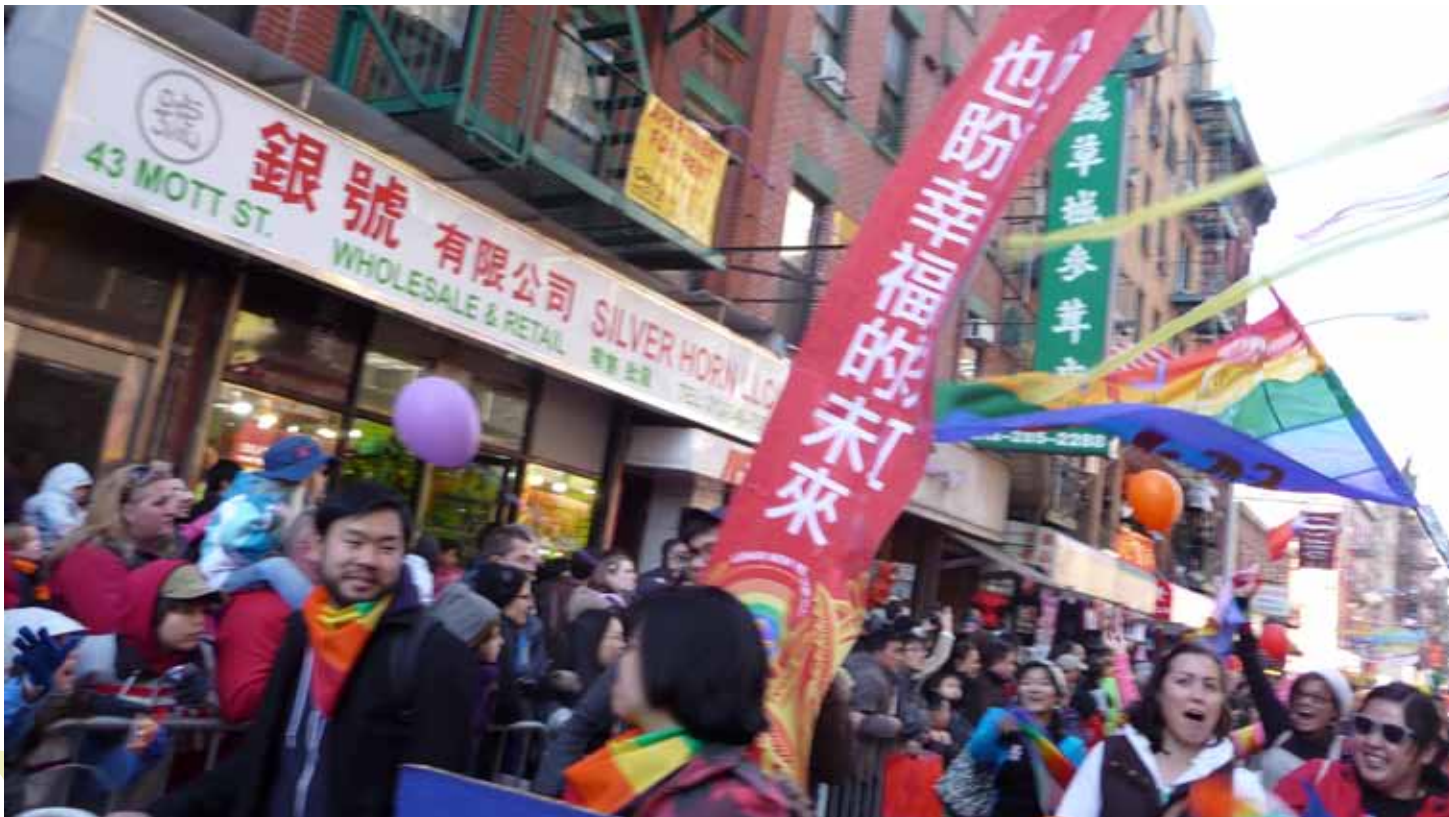
APICHA was part of the first lesbian, gay, bisexual, and transgender contingent to march in the Chinatown Lunar New Year Parade. Over 250 A&PI LGBTQIs carried the traditional Chinese symbols for prosperity and renewal – fish and phoenix. Participants also wore rainbow bandanas symbolizing the LGBT Pride flag.