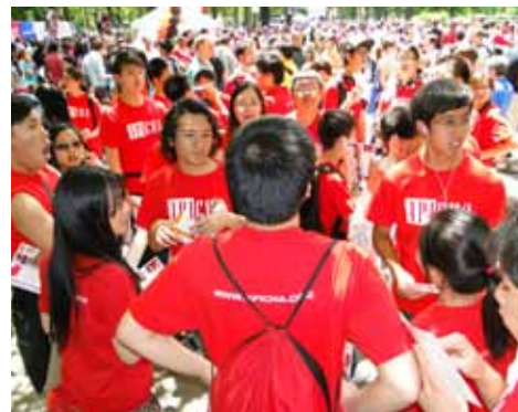
APICHA ensured there was an A&PI-LGBT contingent in the long line of walkers at this year's New York AIDS Walk. As new HIV diagnoses continue to grow, funds that address the HIV prevention and care for A&PI-LGBT community are becoming increasingly scarce. The group of mostly young A&PI was a reminder that our communities remain affected by HIV/AIDS. In addition they helped to raise vital funds to support APICHA's work.